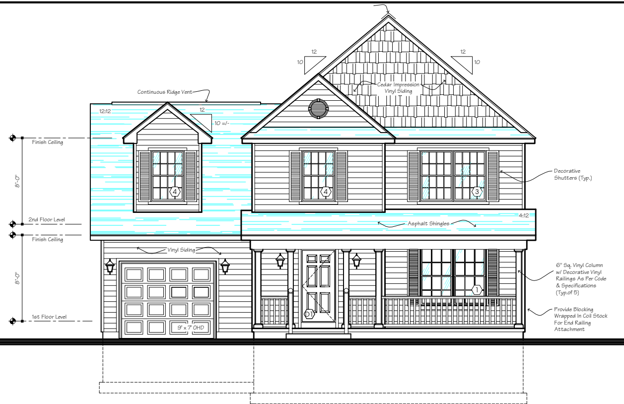
A2.1 Front Elevation