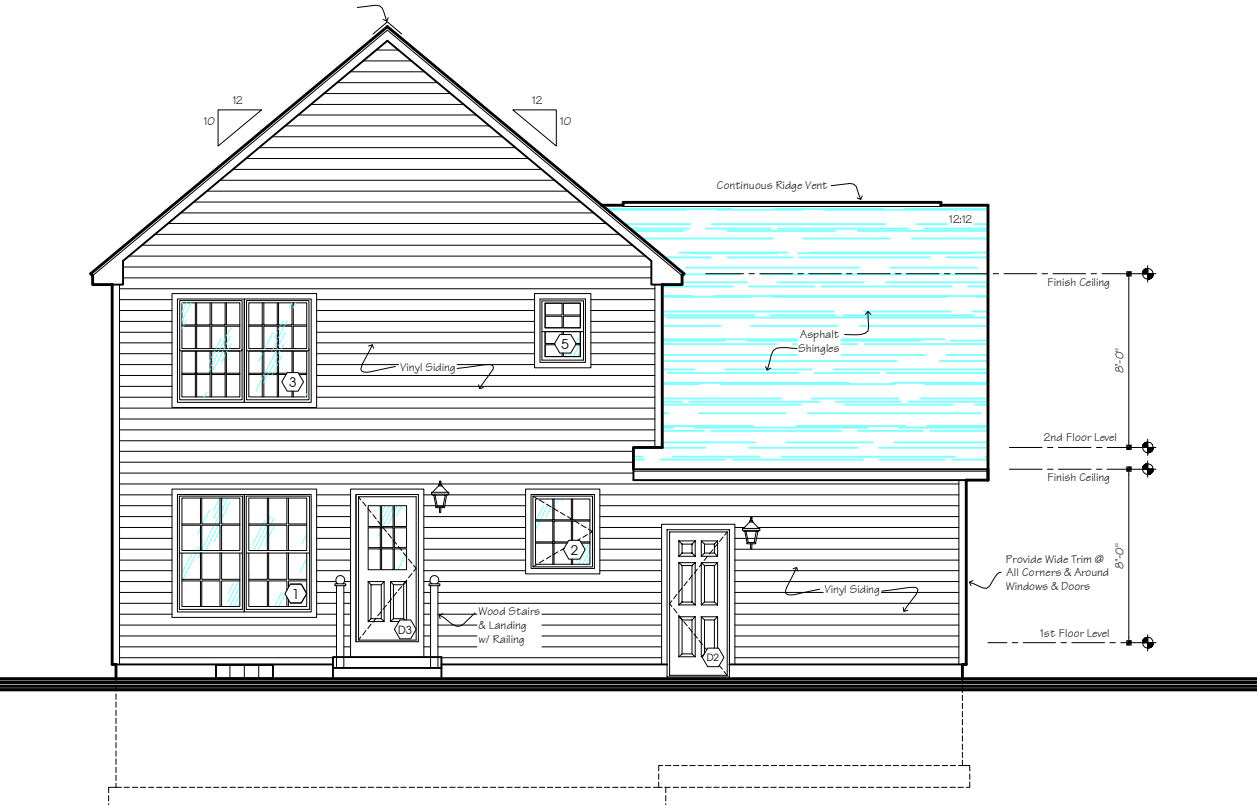
A2.3 Rear Elevation