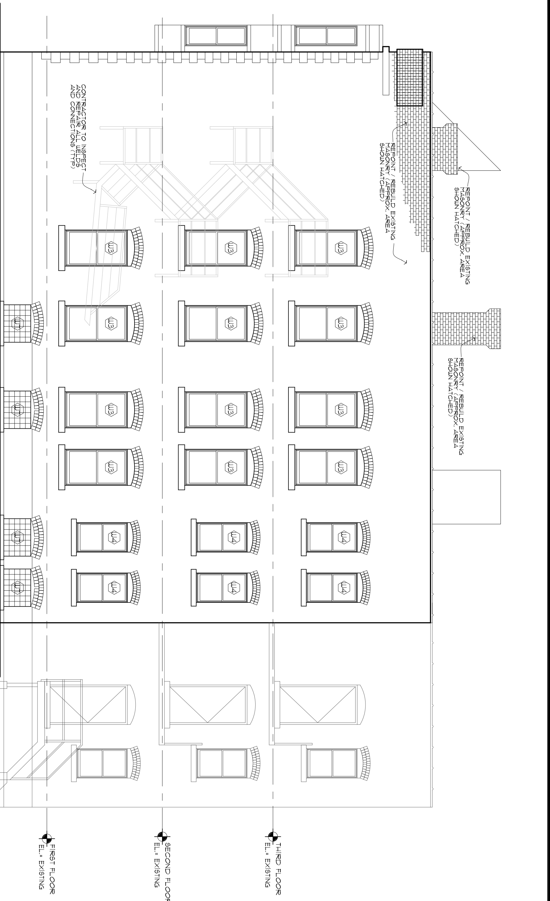
NORTH ELEVATION SCALE 1/4" = 1'-0" (A200)