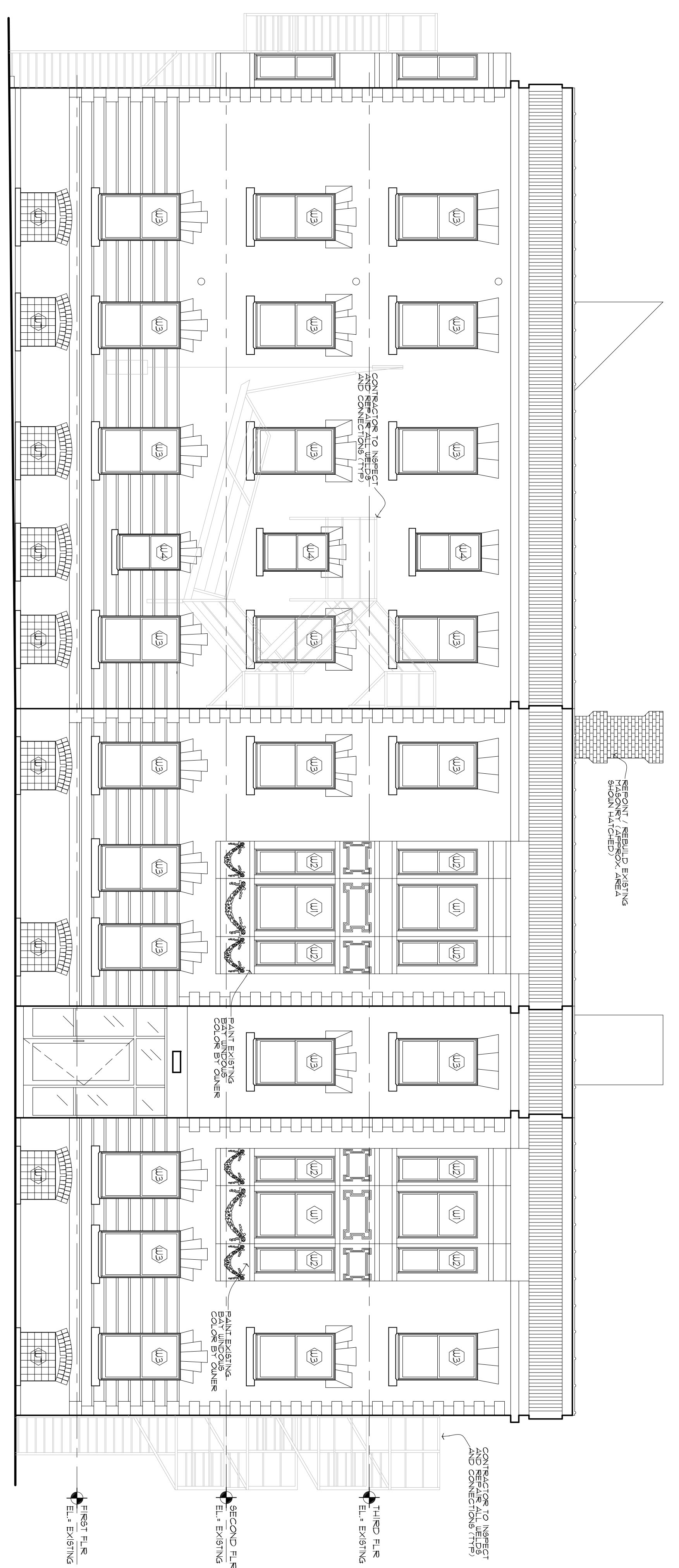
TENTH ST. ELEVATION (EAST) SCALE 1/4" = 1'-0" (C200)

GENERAL NOTES 1) CONTRACTOR TO INSPECT EXISTING BRICK / MASONRY AREAS. REPORT / REBUILD AREAS AS NECESSARY (SHOWN HATCHED ON DRAWINGS). NOTIFY ARCHITECT IF AREAS NOT SHOWN ON DRAWINGS.